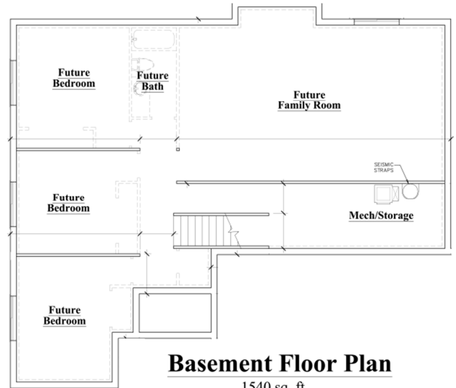
Basement Floor Plan